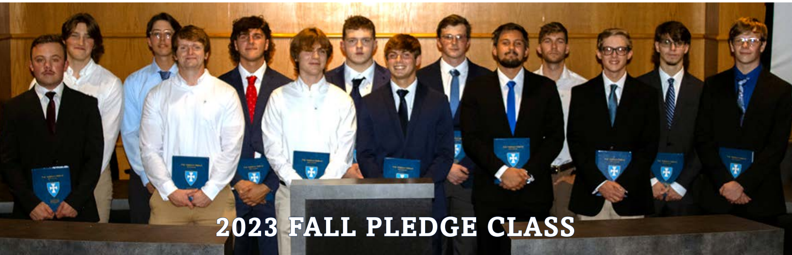
2023 FALL PLEDGE CLASS