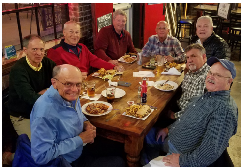
Alumni gather for lunch before the chapter workshop in November 2019.

Attention: This newsletter is intended for Sigma Chi alumni and parents. If your son is still attending Missouri State University, he will receive a copy at the chapter house. If he is no longer in school, please send us his permanent address to update our records. Thank you.