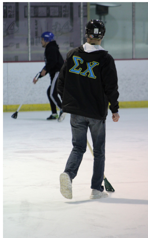
This January, we hosted a broomball rush event with potential new members.