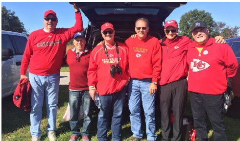
Alumni tailgating at a Chiefs game last September.